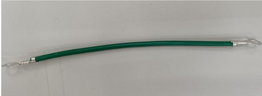
FIG 1. Motor ground cable